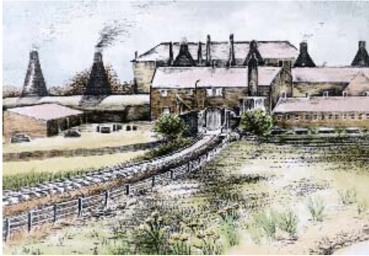
This drawing by Nicola Gill, based on an old photograph, shows the railway line at Belleek Pottery.